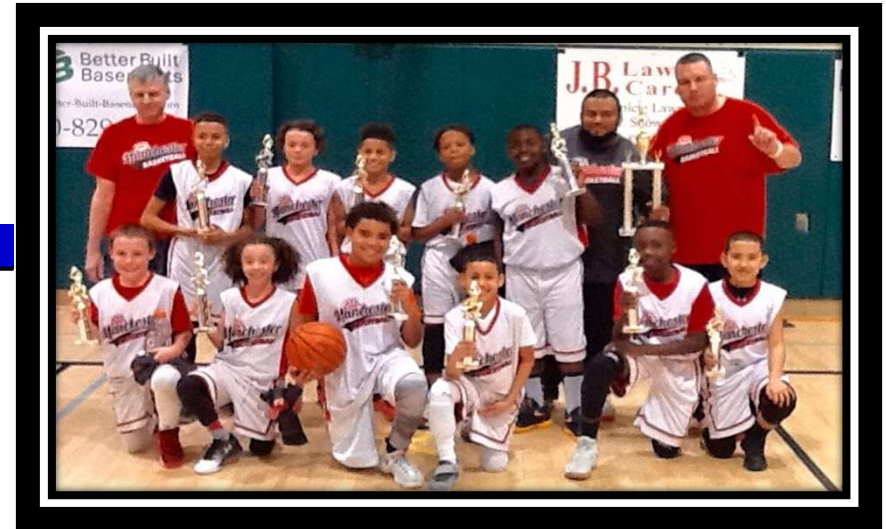
Congratulations to the Manchester Boys White Grade 5 Division 2016/2017 NCCTBL Champions