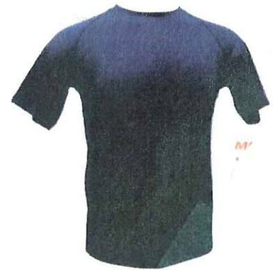
MENS & YOUTH TECH T-SHIRT