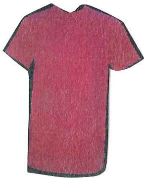
MENS & YOUTH T-SHIRT