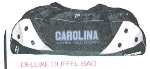
DELUXE DUFFEL BAG