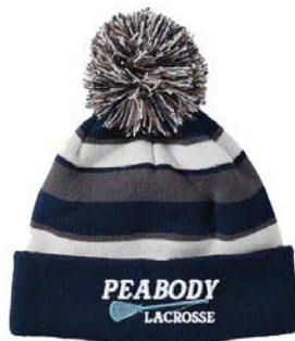
Rib Knit Beanie $19