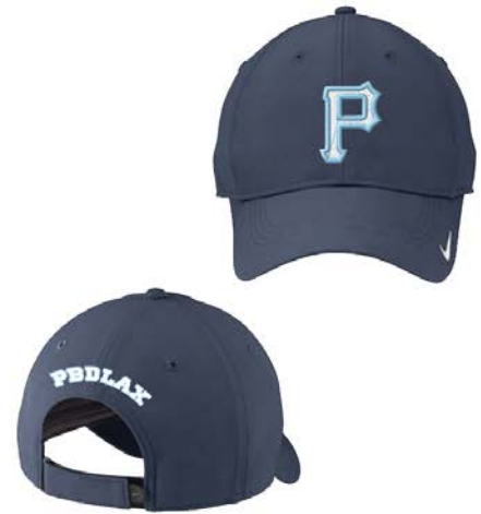
Nike Hat $25