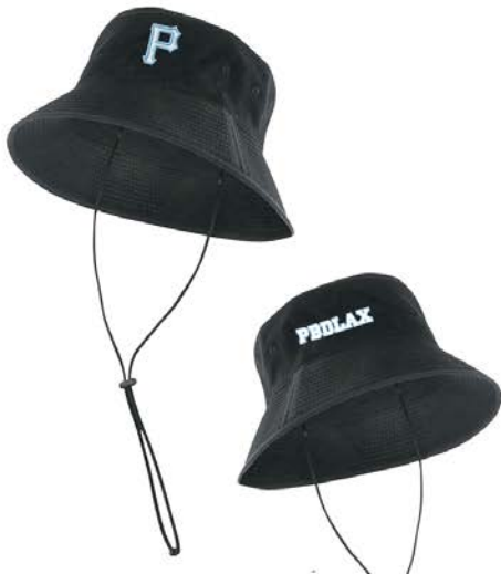
Black Bucket Hat $23