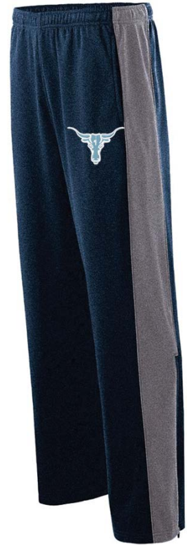
Performance Fleece Pants with Pockets $30