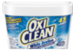
OXI CLEAN WHITE REVIVE