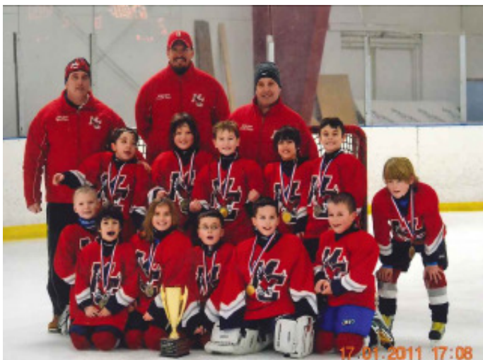
2011 Mite B Champions– MCYH North Team Fisher-Lakeshore Hockey Arena