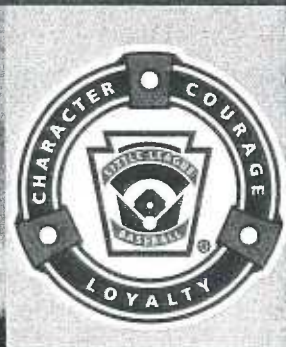
LITTLE LEAGUE BASEBALL