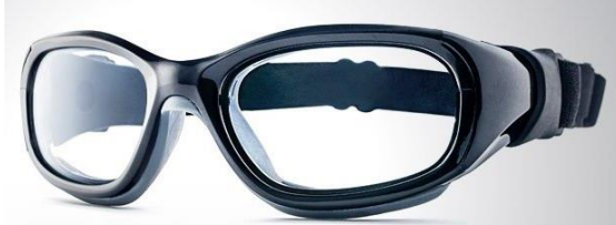
Rec Specs F8 SLAM 49/52/55 EYE (youth – lens option)