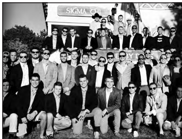
The Psi Psi Chapter celebrating Derby Days, fall 2015.

IHSV, Corey Sandler '19 Chapter Editor (continued on next page)