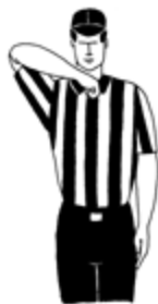
Illegal Body Check