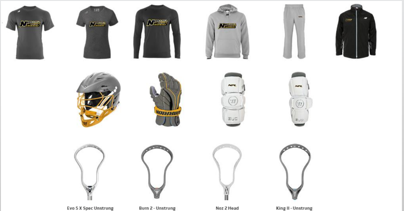
Evo 5 X Spec Unstrung

For all lacrosse apparel and lacrosse gear.