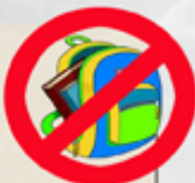
Photo included with all items