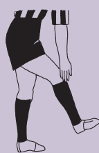
ILLEGAL BALL OFF BODY