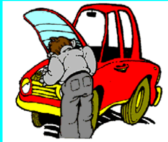
Raffia Road Service Center