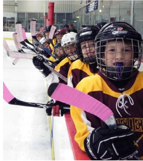
The Squirt A team shows off their support for Breast Cancer Awareness Month with their freshly taped pink sticks