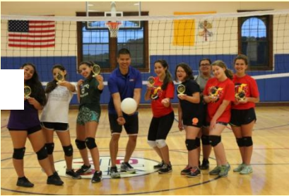
Rec. Volleyball and Instructional Lacrosse launched this past spring!