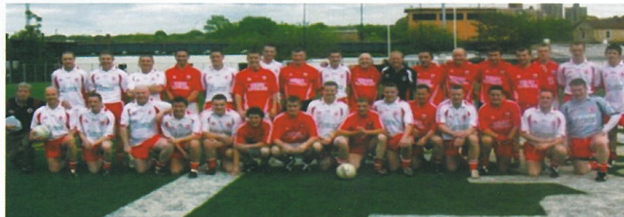
Tyrone versus a New York select with Guests of Honour Peter Canavan and Benny Tierney