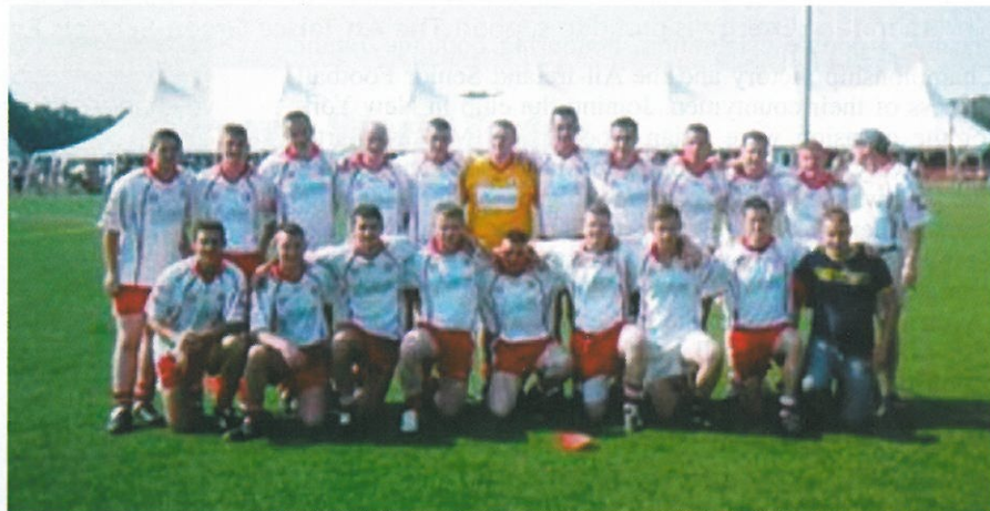
The winners of the Donnelly Memorial Cup