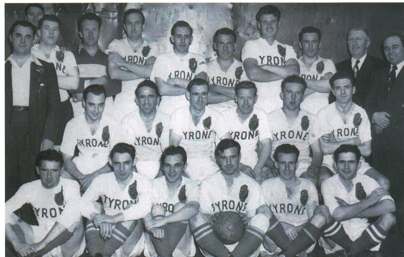
The Tyrone team in New York from 1950