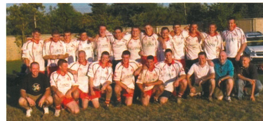
The Tyrone NY junior team that participated in the Four Provinces Fundraiser competition in Philadelphia in 2006

The club held a gala dinner dance in New York in December 2008 which