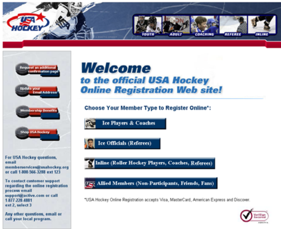
Figure 1: Home Page for USA Hockey Registration

Step 1: Go to the USA Hockey Registration website at www.usahockeyregistration.com