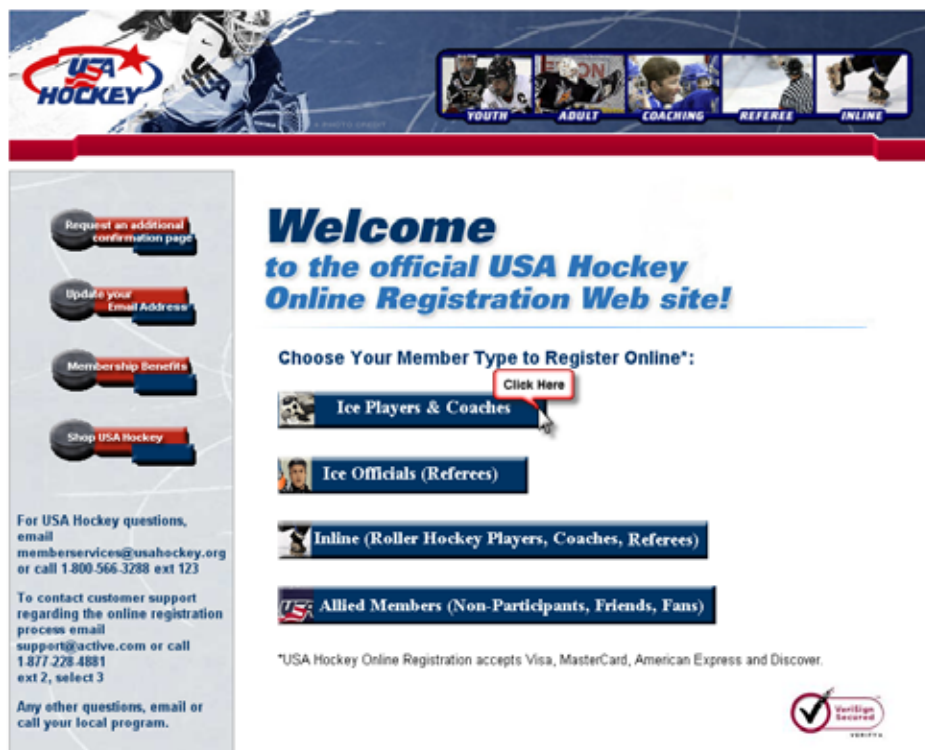
Figure 2: Click on "Ice Players & Coaches"

Step 2: Click on the "Ice Players & Coaches" button